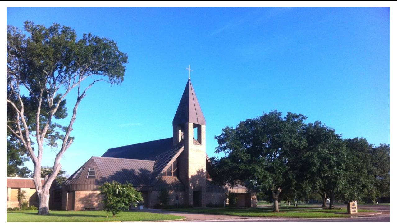
Worship Service: 8:45a.m.

Mission Statement of Salem Lutheran Church As Christ's Disciples, we strive to love and serve all people, sharing the good news of God's grace.