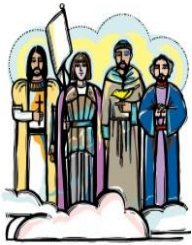
For All the Saints

Sunday, November 3 is All Saints Sunday. This is a time to remember those saints among us who have died since last All Saints Sunday. “The custom of commemorating all of the saints of the church on a single day goes back to the third century” and we will continue this tradition on November 3. While a sad day for some, it is also a day to look ahead to a time of hope, of tears wiped away, when we will join all of the saints in praise to God.